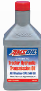
Qualifies as a Universal Tractor Transmission Oil (UTTO)

A typical Universal Tractor Transmission Oil (UTTO) has to simultaneously lubricate gears and hydraulic system components, support the wet braking system, inhibit corrosion, resist water and act as a medium for generating elevated hydraulic pressures to operate ancillary equipment. The lubricant's performance is especially critical to proper operation of hydrostatic transmissions. It takes a precision formulation to meet these demands, and AMSOIL formulates Synthetic Hydraulic/Transmission Fluid with the advanced synthetic technology needed to maximize equipment performance and life.