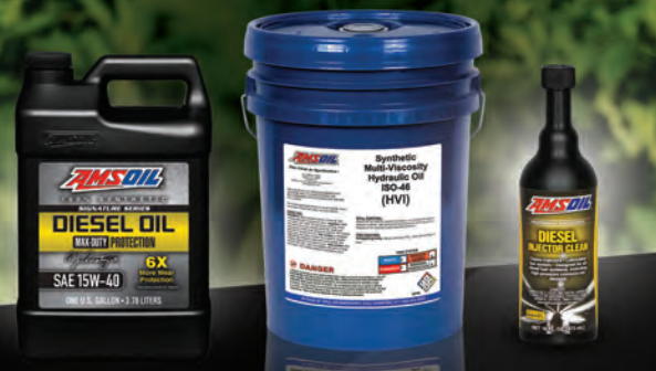
SYNTHETIC DIESEL OIL