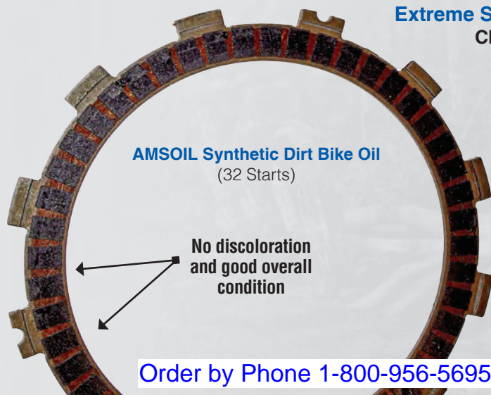
AMSOIL Synthetic Dirt Bike Oil (32 Starts)

No discoloration and good overall condition